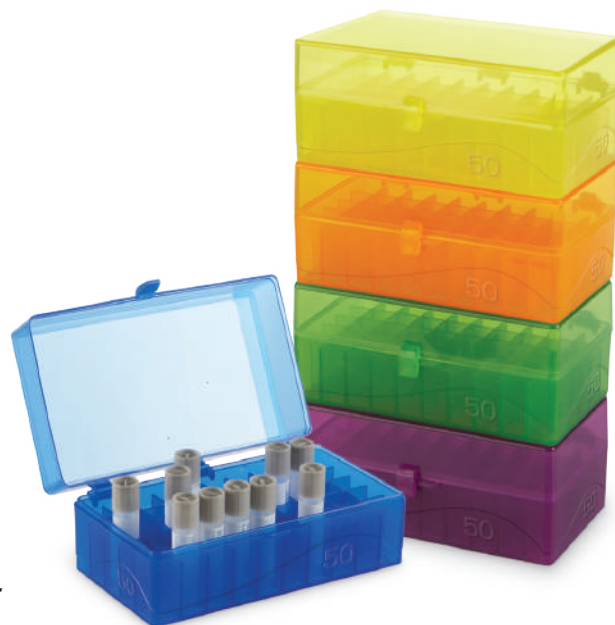
Pack of 5